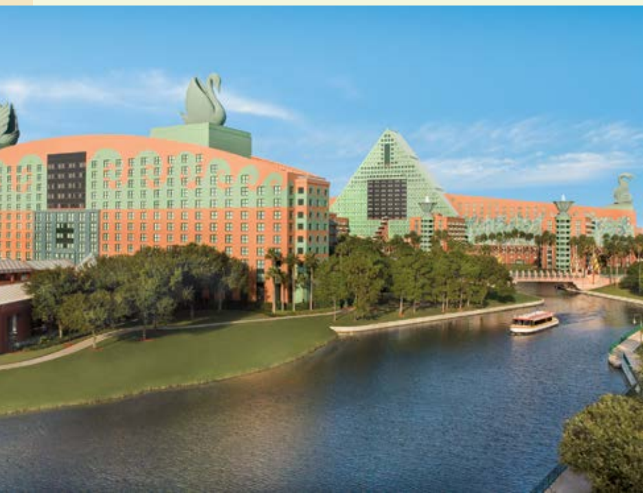
Walt Disney World Swan and Dolphin Resort features more than 331,000 square feet of meeting and event space.

"The first thing that sold me on the property was its location," she says. "There are just any number of things that people can get out and do after hours on their free time if they're staying there. It's convenient to everything, including Restaurant Row on Sand Lake Road, which is very important. The second factor, however, was that even though you're right in the middle of everything, you don't feel like you're in the middle of everything. You feel like you're at a quiet, private resort, which you are. You really have