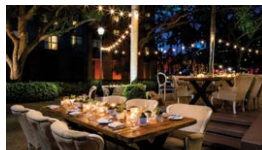
Impressive Meeting Venues