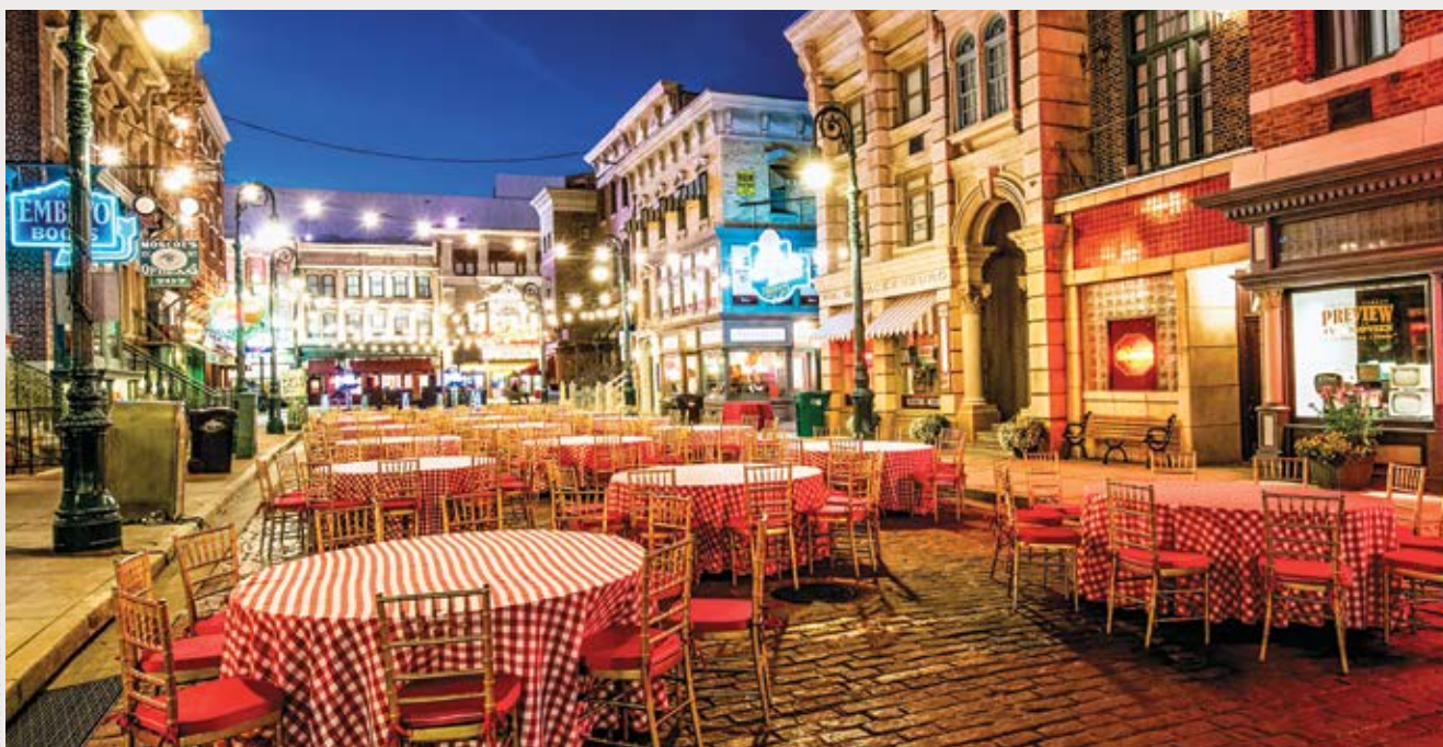
Groups can buyout Universal Studios for a private event and have access to the many outlets the theme park offers.