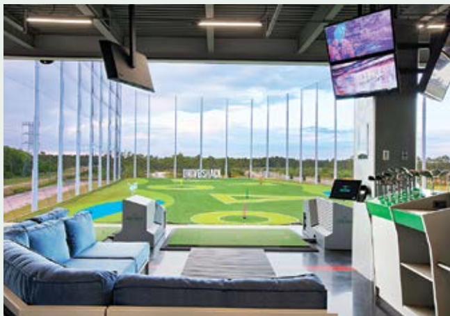
Drive Shack Orlando boasts 90 climate-controlled bays that feature state-of-the-art golf and gaming technology, lounge seating and dining.

"Although a lot of meeting planners are not aware it's there until we bring it up, Kennedy Space Center is one of the most popular offsite venues for groups," Burgoa says. "Once planners learn about it, they get very excited because it's something that you can only find in the Orlando market." Kennedy Space Center is also popular with many of Valentine's DMC clients. "It's just a home run every time for groups," she says. "It's a totally unique venue that is fascinating. It's really spectacular as a VIP-type event for smaller