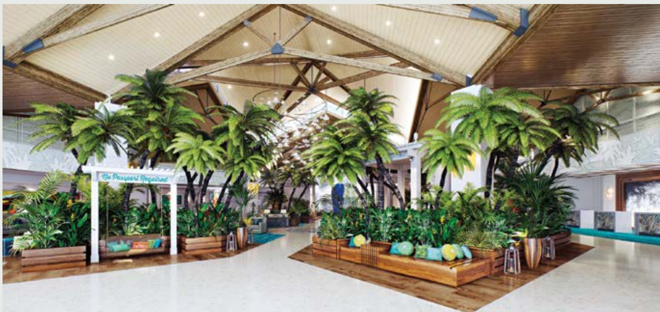
The new Margaritaville Resort Orlando will have more than 40,000 square feet of tropical-inspired indoor/outdoor spaces.

of meeting space, will open early this year, bringing to town Jimmy Buffett's unique vision of what's being called "an island state of mind."