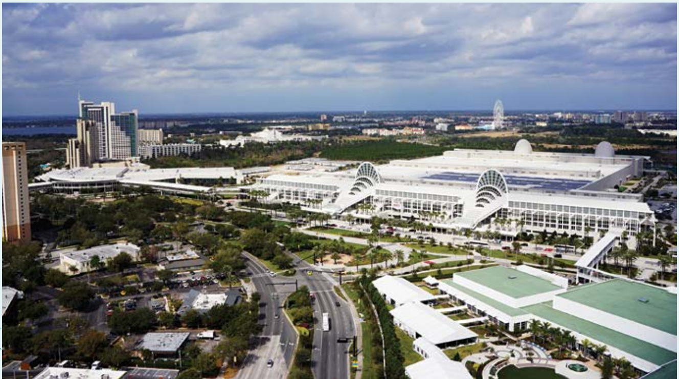
An aerial view from the North-South Building shows the downtown skyline and ICON Orlando in the background.

Plans call for the new project to take place in the North-South Building. "We're also creating a new, very modern concourse between the North-South Building and the West Building. We're adding an 80,000-square-foot ballroom and new meeting rooms, as well as a 200,000-square-foot, all-purpose venue," Aguel says. "In other words, it will provide planners with a new and exciting kind of flexibility in terms of how the convention center can be used. It's also pillar-free and has a combination of retractable floor