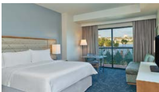
All-New Guest Rooms And Suites