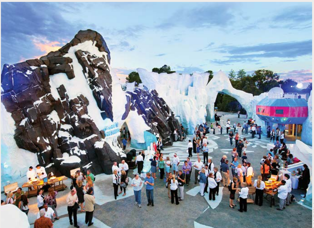
SeaWorld's Antarctica exhibit featuring penguins is among the most popular attractions for meeting groups.