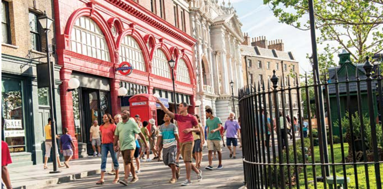
Universal Studios has streets lined with great shops and restaurants.

"We did a night that attendees are still talking about," she says. "It featured all of the attractions and a load of food and beverage, as well as five different musical acts that were staged throughout the venue. We used the Hard Rock Live stage and also built a stage in another location. Our attendees got to enjoy the Islands of Adventure theme park, as well as Universal Studios. And, everybody raved about the venues.