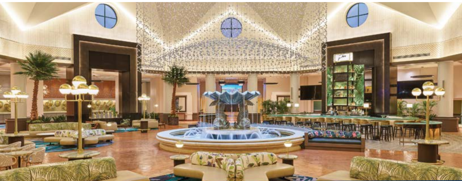
All-New Walt Disney World Dolphin Lobby

The Walt Disney World Dolphin lobby has undergone a $12 million re-design, the final stage of a $150 million renovation project, the largest makeover in the resort's history. It has completely transformed into a sleek, contemporary space featuring new food and beverage options and offer an inviting area for guests to relax or network. A recipient of the prestigious Meetings & Conventions Hall of Fame Award, the Walt Disney World Swan and Dolphin is a nationally respected and recognized leader in the convention resort arena. The resort offers more than 331,000 sq. ft. of meeting space, 86 meeting rooms, and 2,270 guest rooms and suites which feature the Westin Heavenly® Bed. Attendees can also relax in the luxurious Mandara Spa, indulge in one of our 17 world-class restaurants and lounges or enjoy our unique Disney Differences.