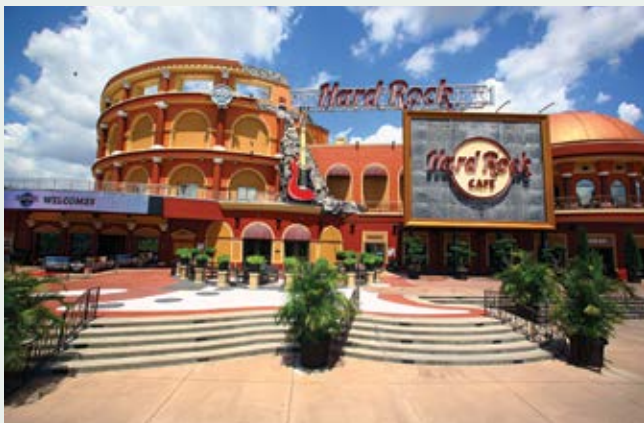
Hard Rock Live in Universal's CityWalk is a "black box" theater, so it can be transformed into whatever is needed.

"We use Hard Rock Live quite a bit," Valentine says. "The great thing about Hard Rock Live is that it's located on Universal's CityWalk, so there are lots of things to do on your own after your private event. You can spend the rest of the evening there and find something to do that you'll like. The other good thing about Hard Rock Live is that it's basically