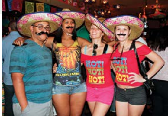
Rocco's Tacos has a private room for special events.