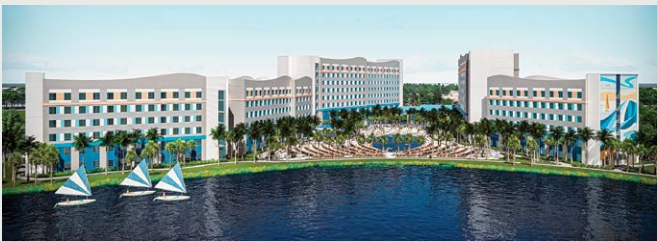
Affordability is key to the 750-room Universal Endless Summer Surfside Inn & Suites, set to open later this year.

And, perhaps most exciting of all, a new 184-room Margaritaville Resort Orlando, with 40,000 square feet