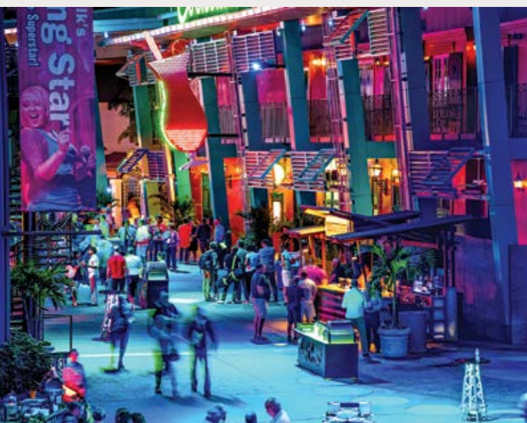
Street parties are extremely popular with attendees looking to enjoy the ambience of Universal's theme parks.