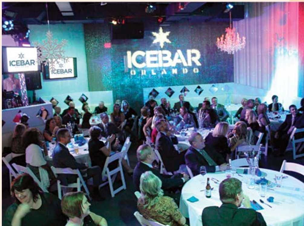
ICEBAR Orlando has more than 5,100 square feet of space to host an event.