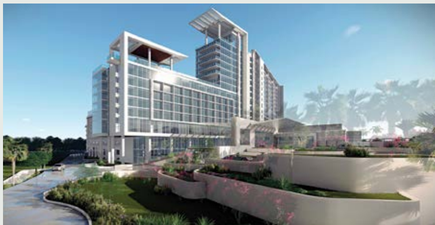
JW Marriott Bonnet Creek will offer upscale lodging when it opens in 2020.

"We also have a second JW Marriott property coming