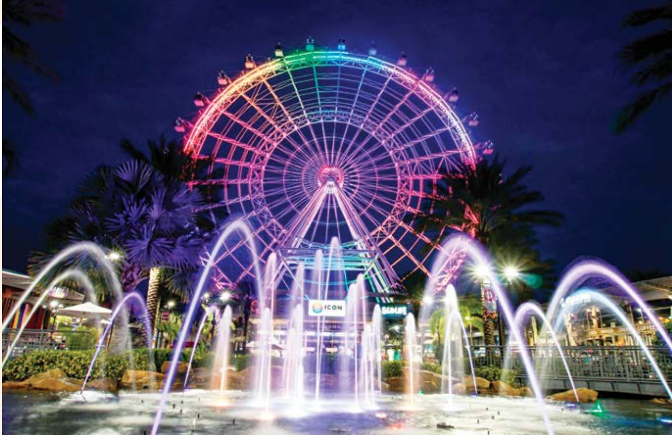
At 400 feet tall, ICON Orlando offers extraordinary views of downtown Orlando, the theme parks and more.