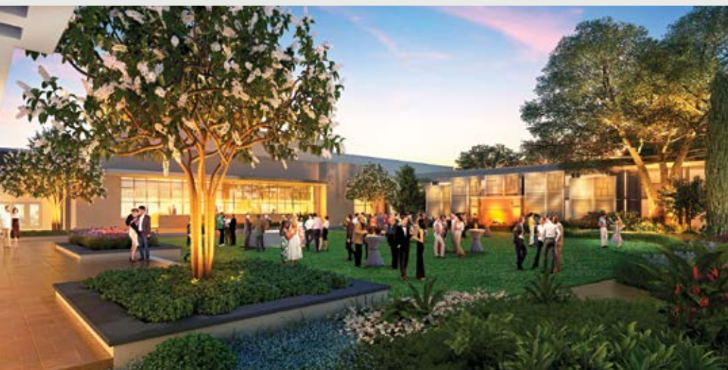
Outdoor events at the DoubleTree by Hilton Orlando at SeaWorld are surrounded by lush tropical landscaping.