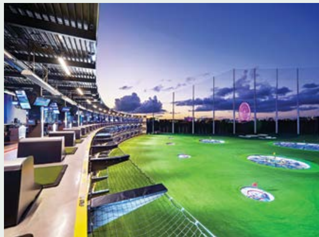
Topgolf Orlando is a sports entertainment pavilion that is fun for all skill levels.

groups because you can do things like a luncheon that features an astronaut as your speaker."