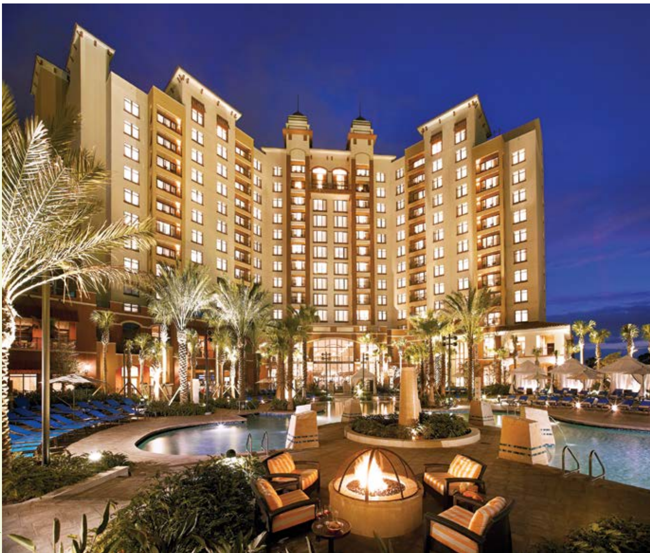
The stunning Wyndham Grand Orlando Resort Bonnet Creek overlooks a beautiful lake and offers top-notch service.

The AAA Four Diamond, 1,641-room Hyatt Regency Orlando, which in its former incarnation was the legendary Peabody Orlando, features 315,000 square feet of meeting and event space, which includes five ballrooms, 105 breakout rooms, a 56,000-square-foot rotunda with 53-foot-tall floor-to-ceiling windows and 52,000 square feet of outdoor function space.