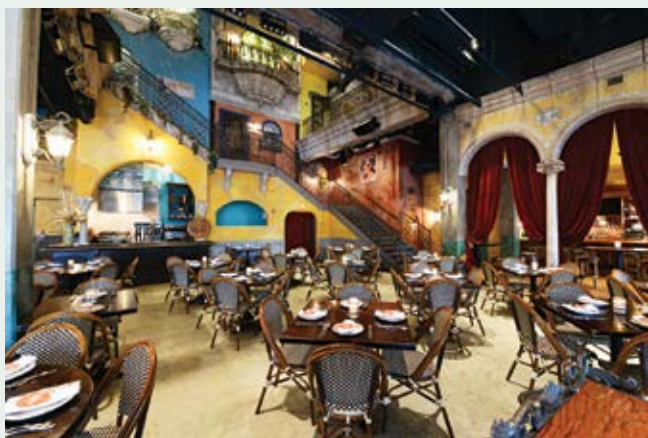
With delicious food and great ambience, Cuba Libre Restaurant & Rum Bar is an ideal venue to host an event.